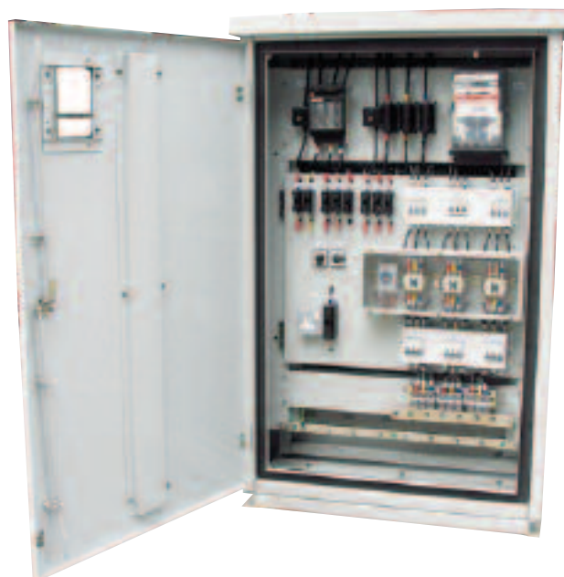
Inside wiring of the SLFP-100